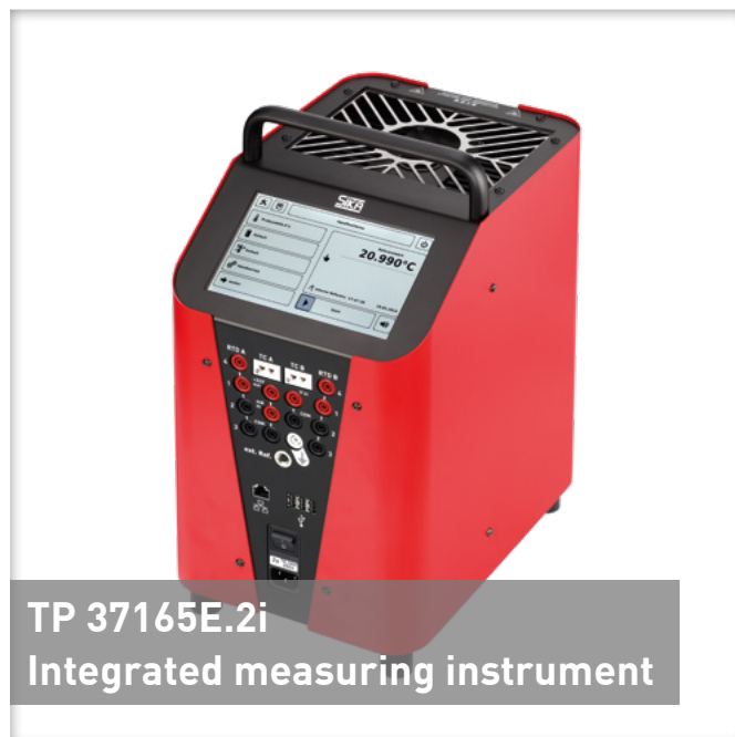
TP 37165E.2i Integrated measuring instrument